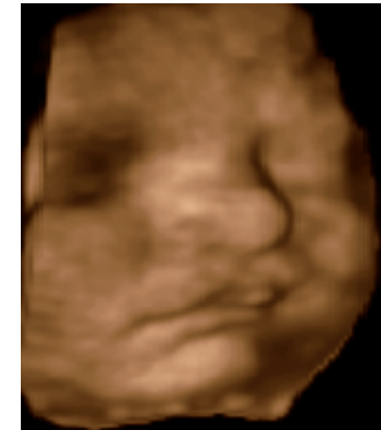
38 Weeks Gestation