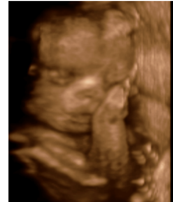
27 Weeks Gestation

Gift Certificates: We offer gift certificates, which can be purchased for the expectant parents. Makes a great and memorable baby shower gift.